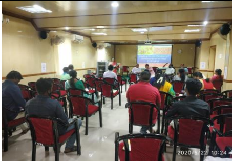
Training programme at Karaikal , UT of Puducherry