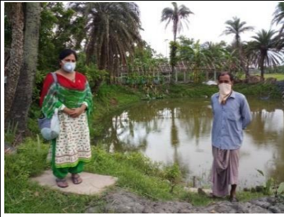
Field visit at Akshaynagar village (AMFU, Kakdwip)