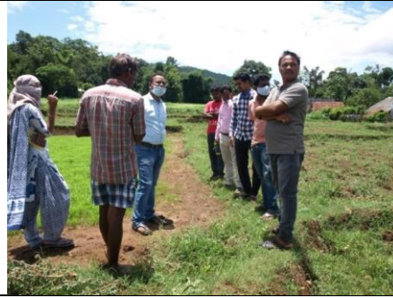
Field visit at Yeblum, Devarapalli & Ligavaram villages (AMFU, Chintapalle)