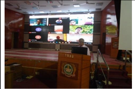
Training programme at AMFU, Coimbatore