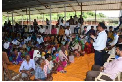
Training programme at AMFU, Chintapalle